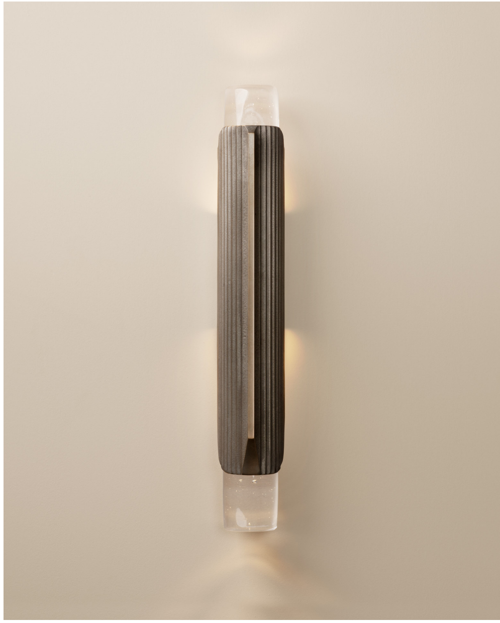
Shown in Silver Dollar Bronze and Clear Glass