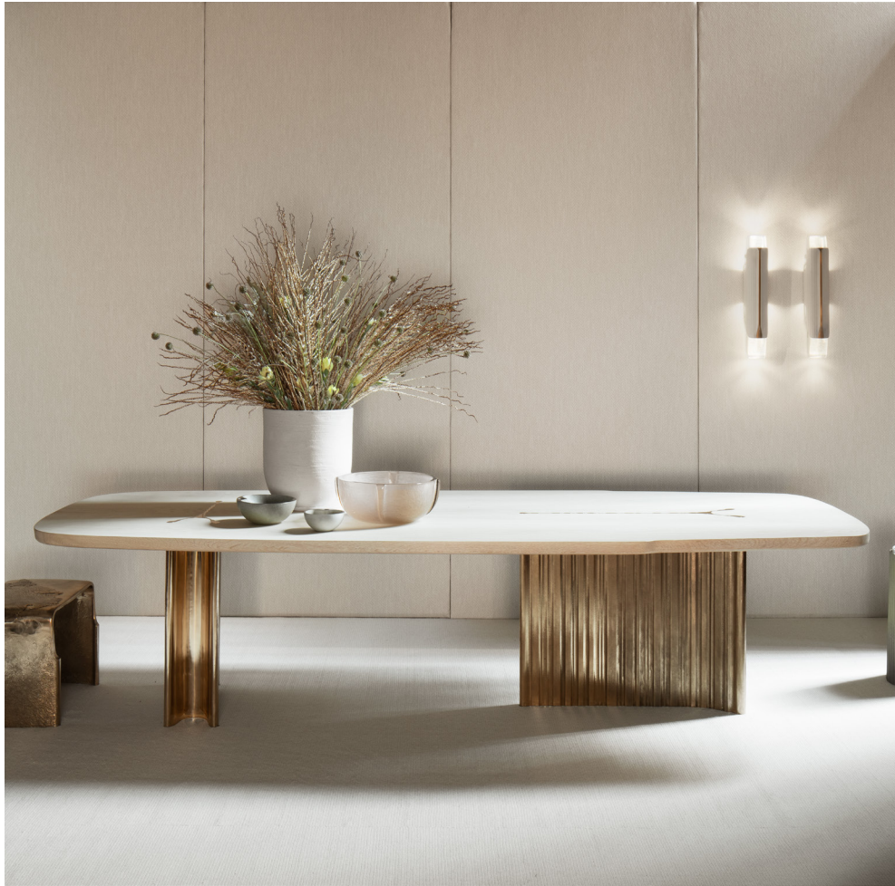
Shown in Polished Bronze and Caliche Oak Wood