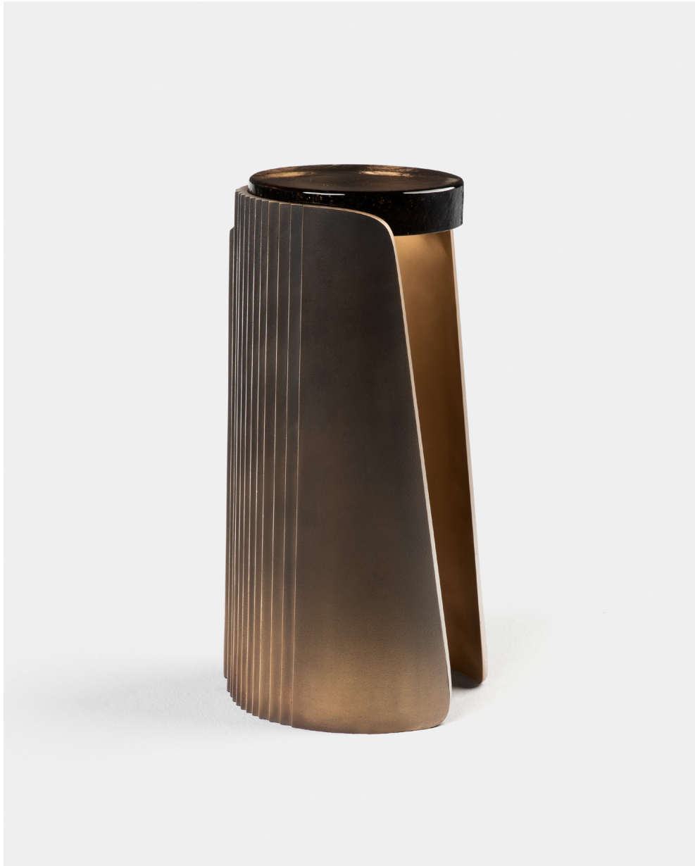
Shown in Otter Bronze with Natural Ombre