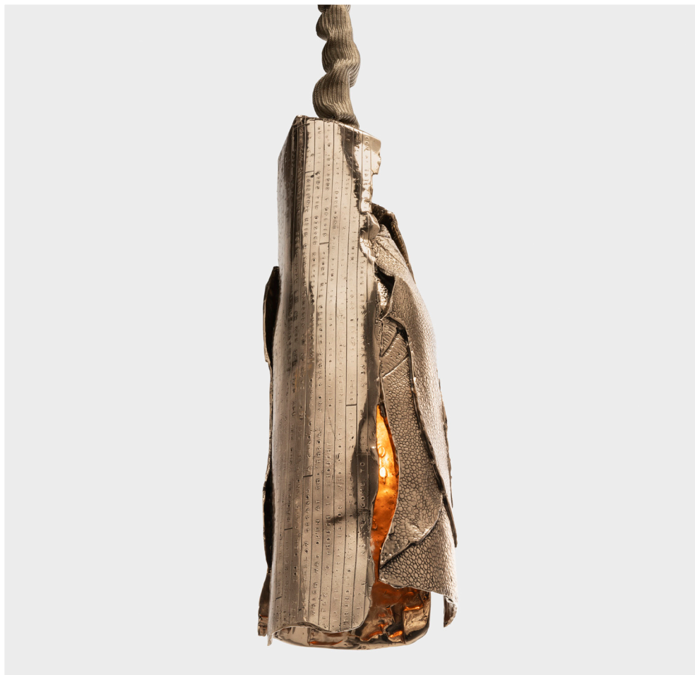
Shown in Polished Bronze