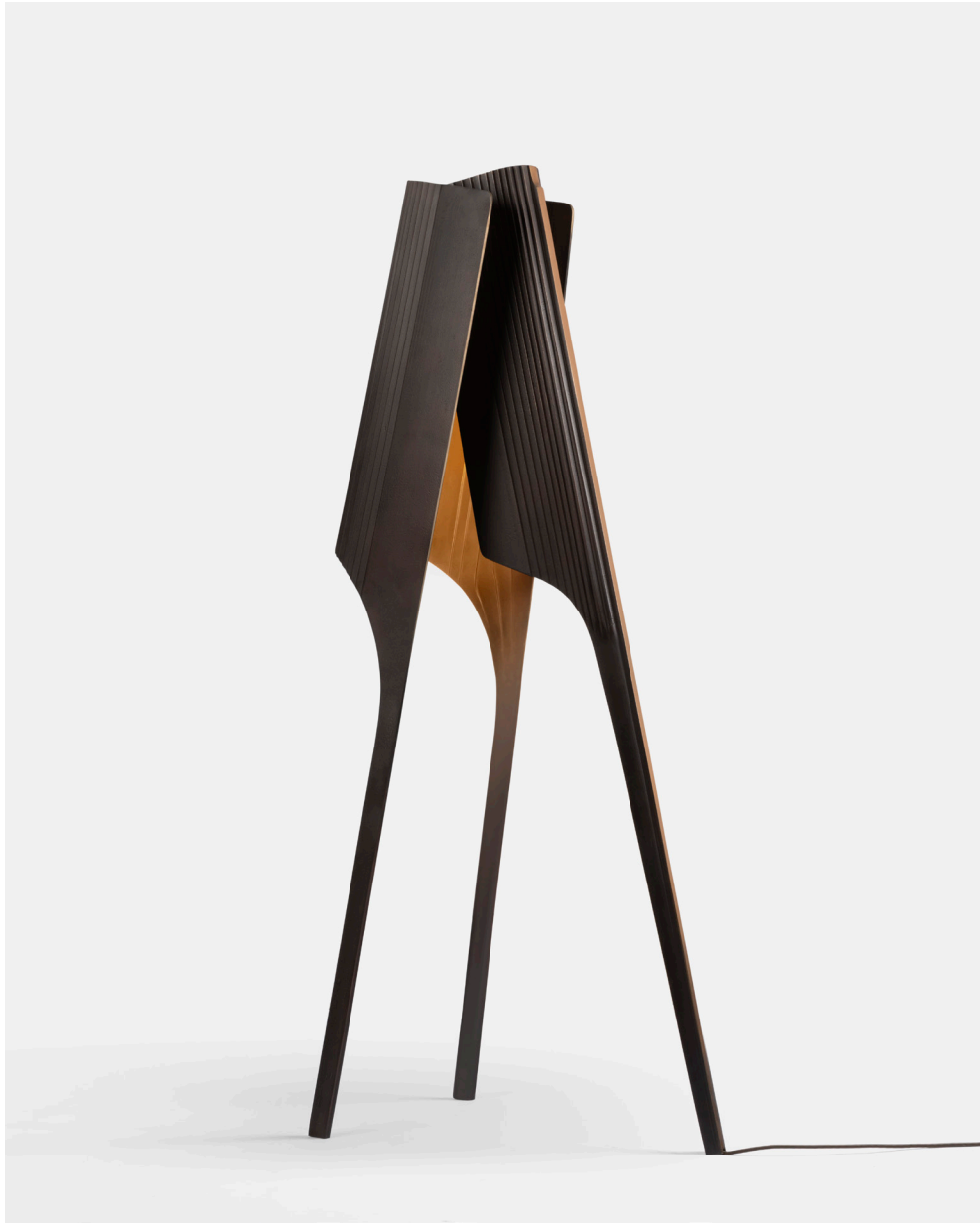
Shown in Otter Bronze