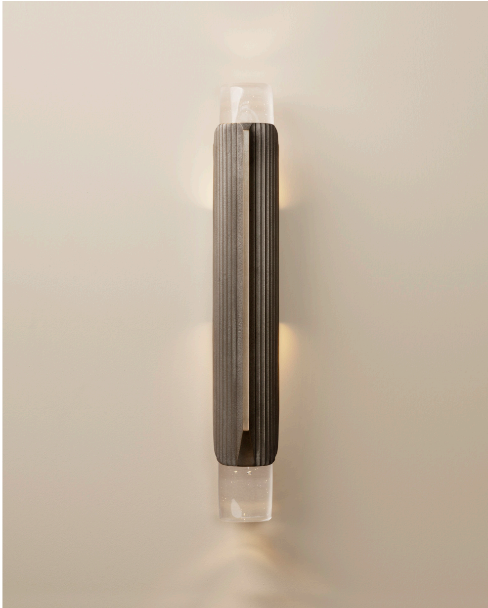
Shown in Silver Dollar Bronze