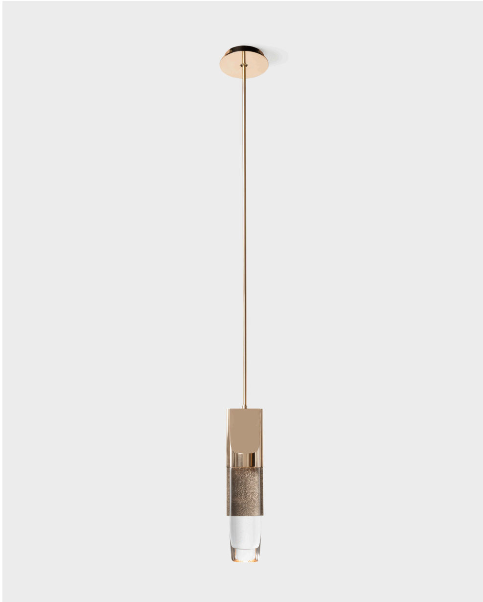
Shown in Polished Bronze and Shale Glass