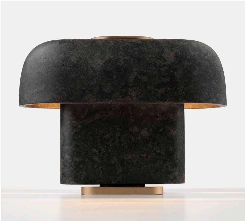
Shown in Trailhead Cast Mineral Shade, Trailhead Cast Mineral Lamp Base, and Lucent Metal